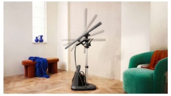
Easily adjust to preferred angle, support vertical, tilt and horizontal steaming.