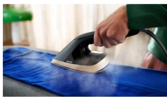
Light-weight iron+ head at up to half the weight of our regular steam irons**